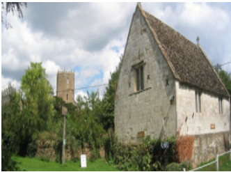
TOM BROWN'S SCHOOL MUSEUM SPRING EDITION