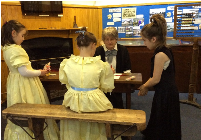
Making peg dolls