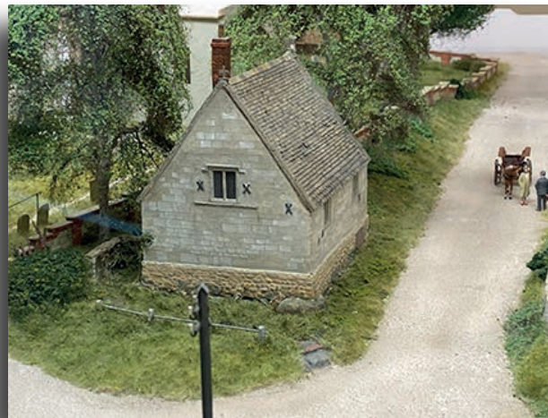
Model of the Old Schoolroom, Pendon Museum

Whatever your level or area of skills, please do contact us to arrange a chat: uffingtonmuseum@gmail.com